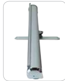
Swivel foot base