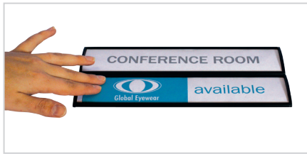
top insert slides left & right