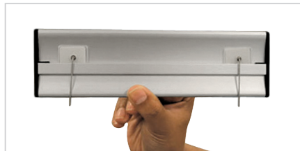
partition pins used to secure frame to fabric wall